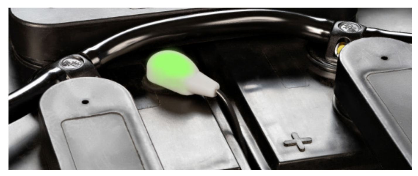
THE ORIGINAL, MARKET LEADING, LOW-COST ELECTROLYTE INDICATOR NOW WITH SIMPLER INSTALLATION AND A SUPER BRIGHT LED