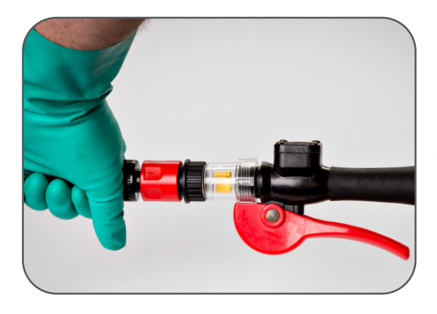
Connect the Instant Valve Pro™ to the Input Assembly of the BIS System installed on the battery.