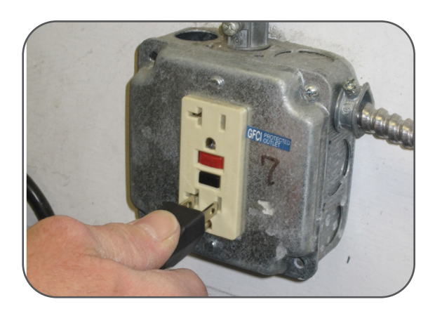
Plug the HydroCart Max into an approved electrical outlet.