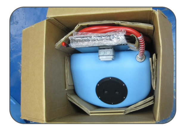
Carefully remove the Hydro-Cart Max from the shipping carton.